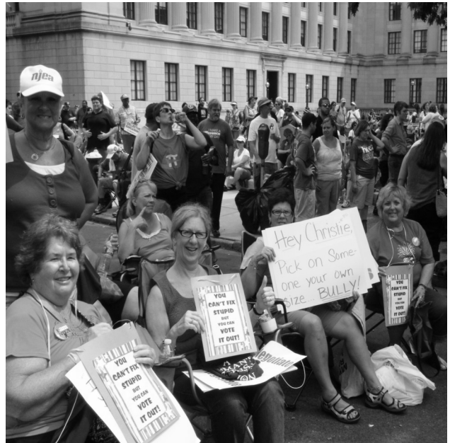
Rally in Trenton— June 23, 2011

I hope to see you at the luncheon on September 19th.